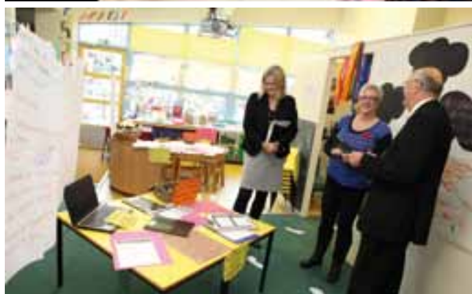
Collaboration: (from top) SLEs facilitate discussion during the Research Café; market place stalls illustrate the learning journey and impact of teachers’ research

from our Research Hubs is exciting. This has created a strong sense of empowerment in which staff regard research-engagement as core to practice development and professional learning.